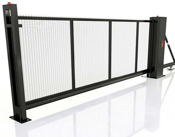
358 High Security Suspended Gate